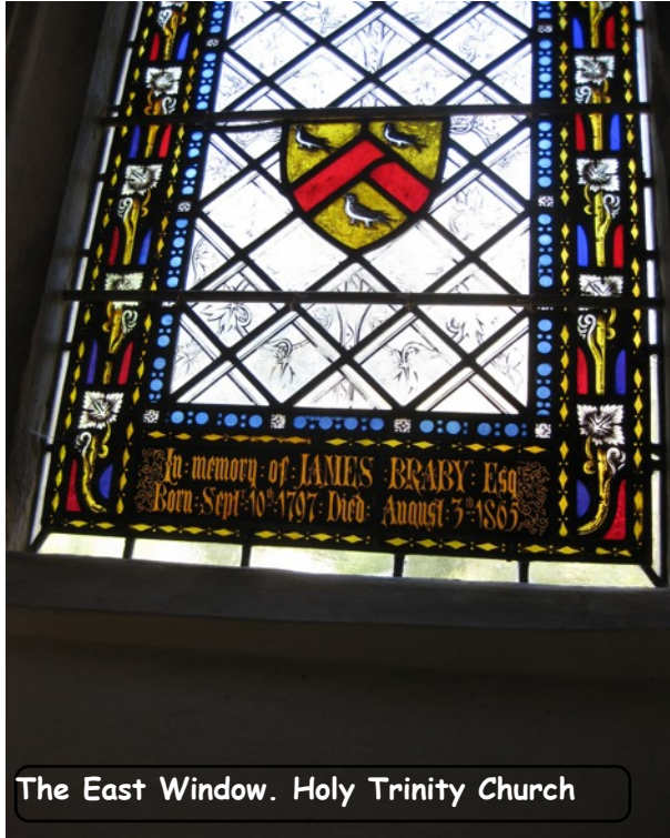
The East Window. Holy Trinity Church